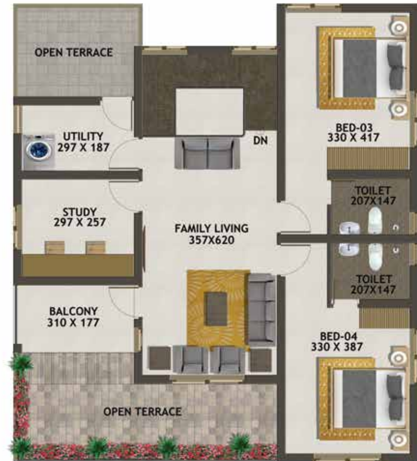
FIRST FLOOR PLAN AREA : 1114 SQ. FT