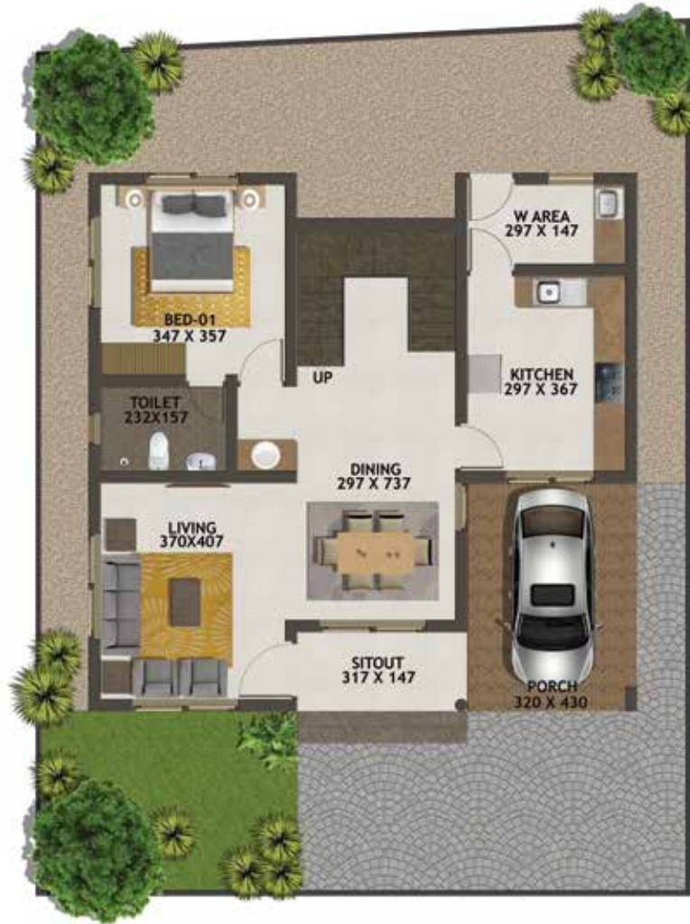
GROUND FLOOR PLAN AREA : 1118 SQ. FT