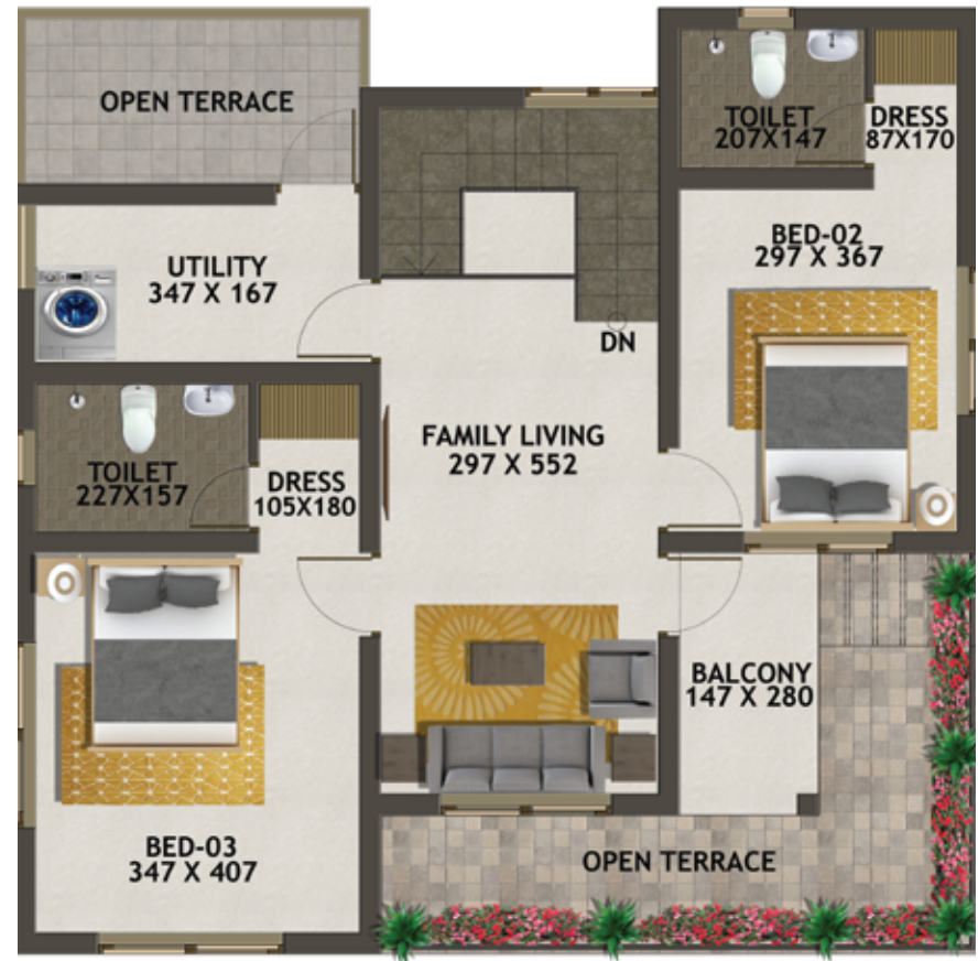
FIRST FLOOR PLAN AREA : 882 SQ. FT