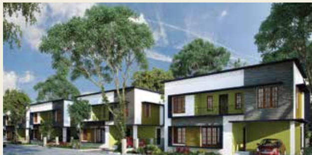
ROSE VILLAS KAZHAKOOTTAM