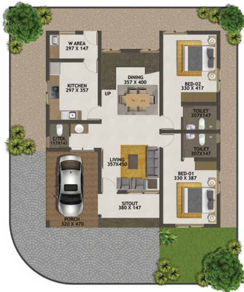
GROUND FLOOR PLAN AREA : 1386 SQ. FT