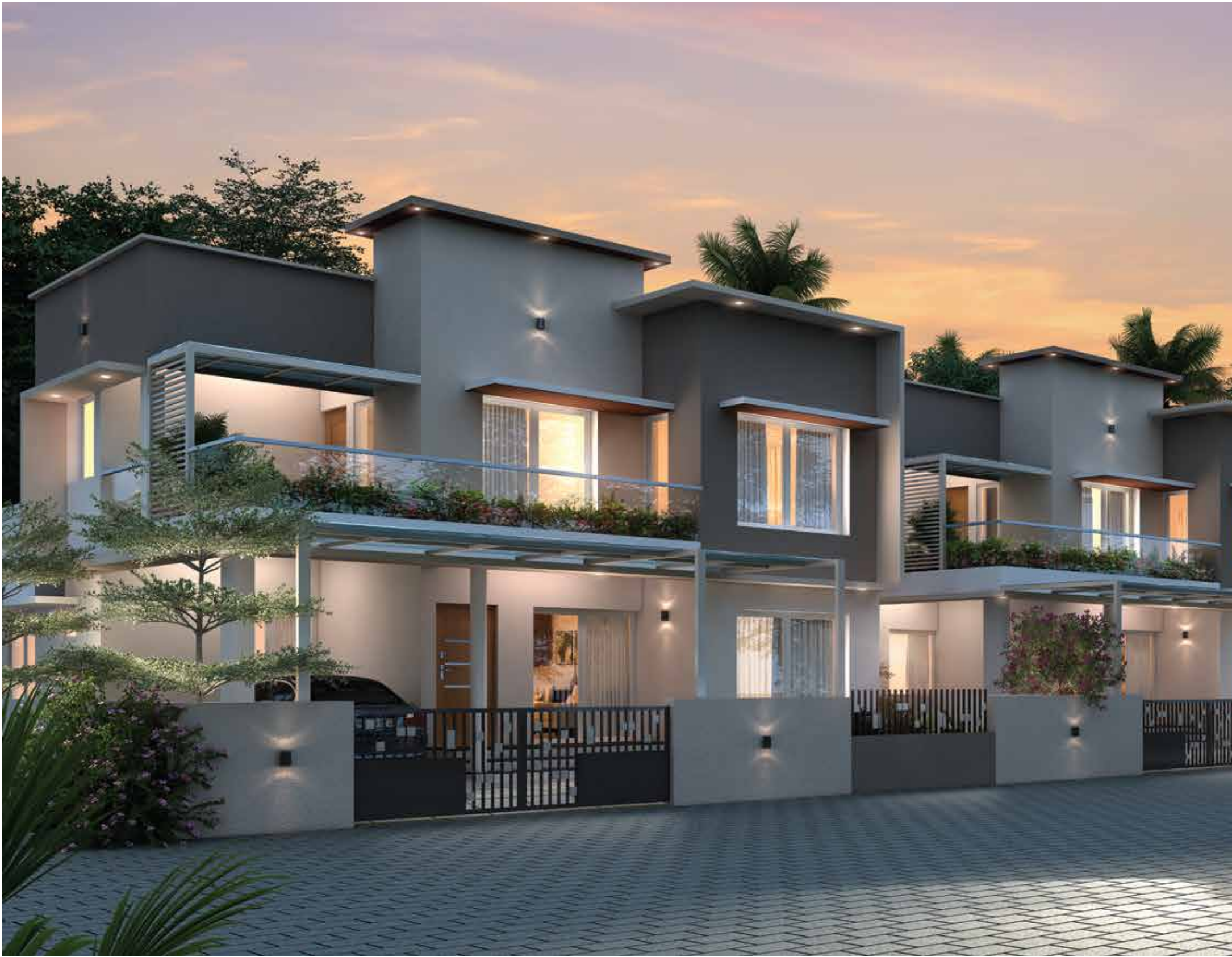
Artistic representation of villa project, changes may occur according to site condition