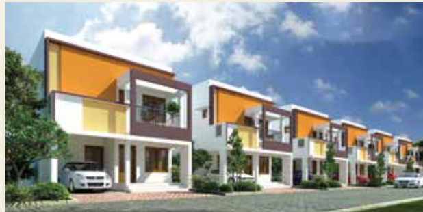
GRAPE VILLA KAZHAKOOTTAM