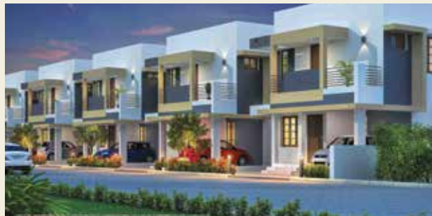
SILVER SPRING KAZHAKOOTTAM