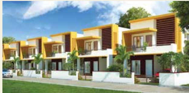
MAPLE VILLAS KAZHAKOOTTAM