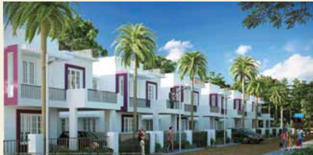
BLUE WAVES KAZHAKOOTTAM