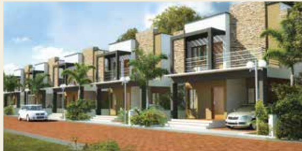
OLIVE VILLAS KAZHAKOOTTAM